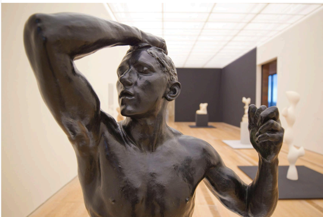
The Fondation Beyeler collection includes Rodin sculptures, above, plus works by Picasso and Warhol

Basel's beautiful medieval old town is dominated by the fairytale town hall. The vivid red façade of the 16th-century Rathaus is a good starting point for a wander. Directly opposite is the family-run Confiserie Schiesser, the oldest coffee house and chocolatier in town ( confiserie-schiesser.ch ). Then head west to Spalenberg, a street lined with quaint boutiques.