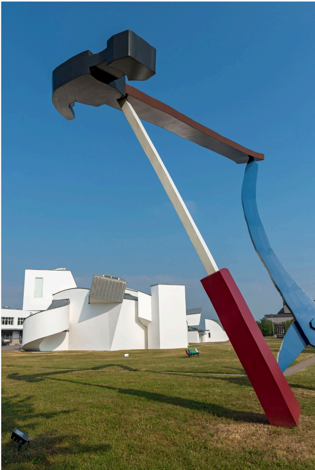
The Balancing Tools sculpture by Claes Oldenburg and Coosje van Bruggen at the Vitra Design Museum