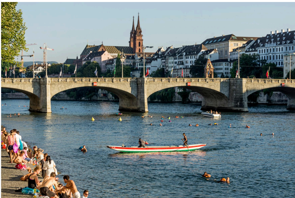
The Rhine is warm enough to swim in until mid-October